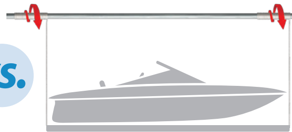
Cables wound around pole or winch drum